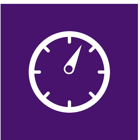
Speed & Delivery